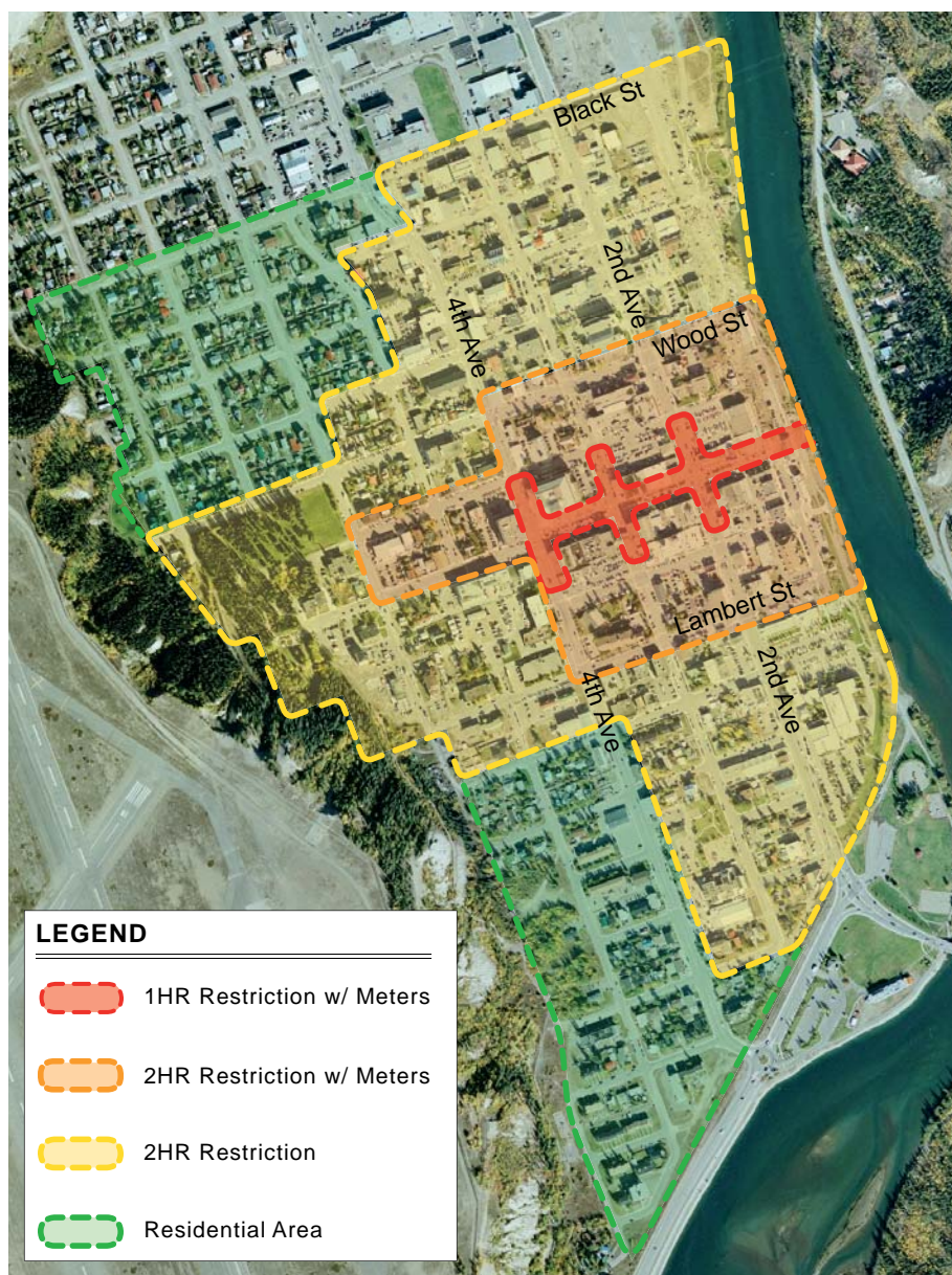
Figure 2 - Recommended Parking Restrictions

The survey of on-street parking spaces also revealed that a considerable number of all-day parkers occupy on-street spaces. These spaces are intended for short-term parking for the adjacent businesses and residents that front these streets and the presence of all-day parkers is impeding their ability to park in these areas, particularly where occupancy rates are high. New parking restrictions are recommended which will extend the range of two-hour meters and two-hour unmetered areas to preclude long-term parking in on-street spaces. A residential parking program will address spillover into adjacent residential areas, while retaining the ability of area residents and residential visitors to park in these areas. See Figure 2 .